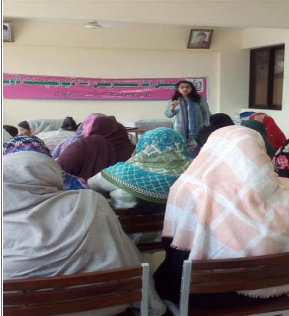
Orientation Session on CSA in Humak