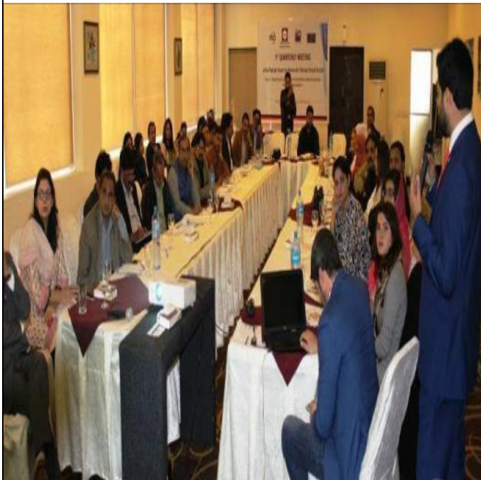
First Quarterly Meeting of PFDP Punjab Chapter