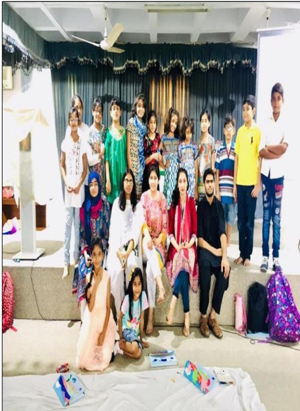
Summer Camp with Women Development Center