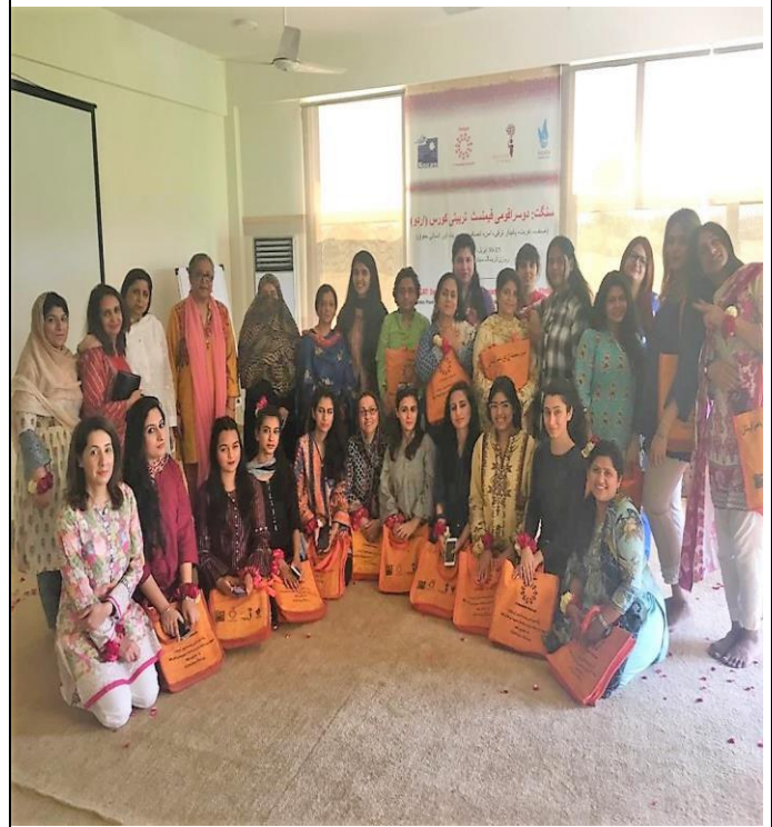
2 nd National Sangat Course