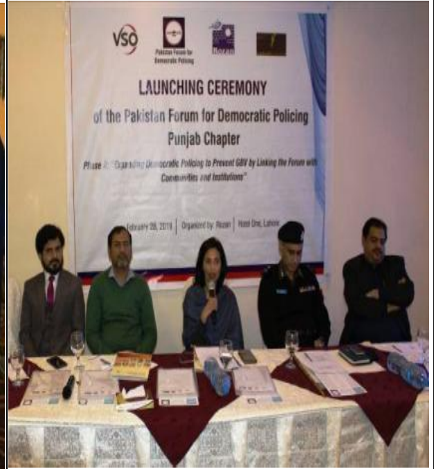
Launching Ceremony of PFDP Punjab Chapter