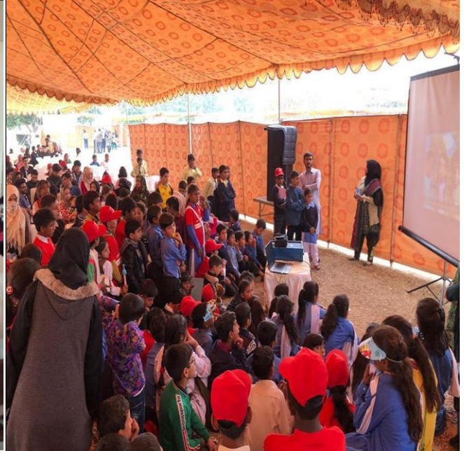
Theater Performance in Kuri Community