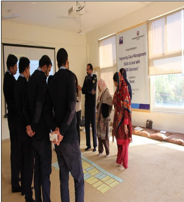
Case Management Training with Service Providers