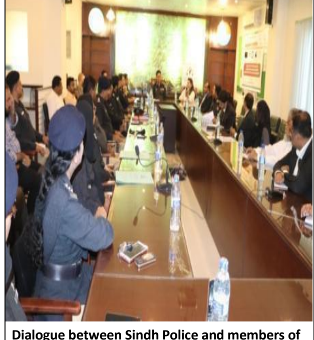
Dialogue between Sindh Police and members of PFDP Sindh on Police Reforms