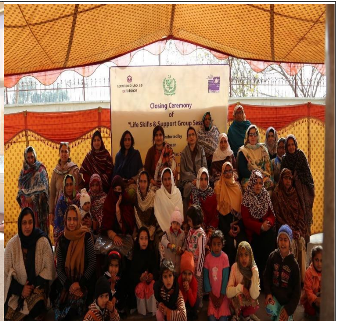
Closing Ceremony of Life Skills and Support Group Sessions in Women Center, Islamabad