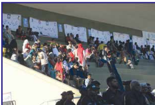
Promotion material used to advocate for gender sensitive and democratic police.