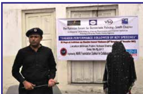
Theatre performance in Sukkur district.