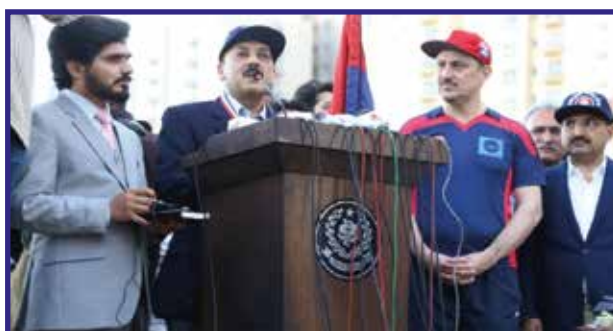
IGP Sindh AD Khowaja addressing the community policing cricket match as chief guest.