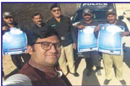
Forum member handed over IEC material to the police.