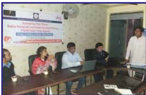
Forum member holding press conference.