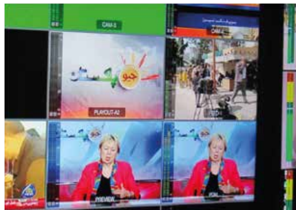
Interview of Ms Burt on one of the leading TV channel