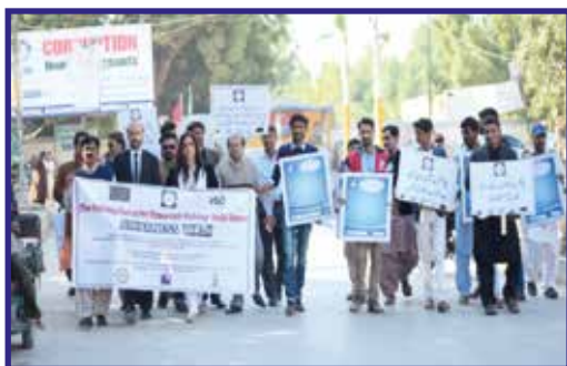
A walk on police reforms.